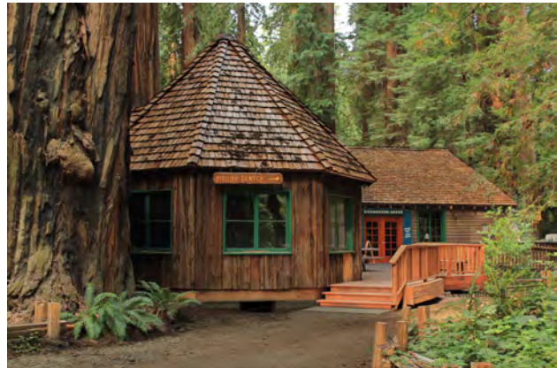
Richardson Grove Visitor Center

Another summer has come and gone. While the number of visitors was slightly less this summer than the last at Humboldt Redwoods State Park, it felt as busy as ever. In addition, the Richardson Grove Visitor Center was open, and will continue to stay open during the weekends well into the winter. Stop by and check it out if you haven't yet! The number of visitors that come in and tell about their memories of past summers spent in the visitor center is impressive. They tend to have a nostalgic look in their eye, and some even come to tears reminiscing about years past. The Richardson Grove maintenance crew has done a wonderful job with the renovations. As always, we try to get new books and merchandise throughout the year, so keep the HRIA Visitor Centers in mind when you start your holiday shopping. We hope to see you soon!