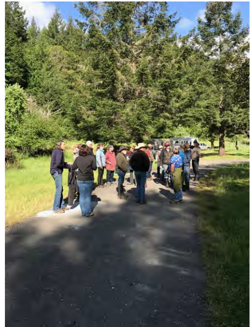
Mounted Assistance Unit members assembling to begin work day.

Spring has sprung and now summer is here! The park is alive with new blooms and is ready for visitors. The Mounted Assistance Unit (MAU), has two camp-out work weekends per year. The spring camp-out is held right after the park opens for the season. This work weekend was focused on getting Cuneo Creek Campground and trails ready for horse enthusiasts to enjoy! It was also the time that prospective members start the process of becoming a MAU volunteer. The process requires, testing in the Spring and Fall & riding 12 hours in the park with an MAU sponsor to learn the trails, policies & procedures. Introducing the rider & their equine to the park, insure that they will be safe and effective representatives of Humboldt Redwoods State Park. The prospective volunteer is also required to do a final test at the fall camp-out to complete their apprenticeship.