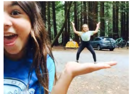
One of the photo contest submissions for 2015 Fun in Burlington Campground

Saturday, October 3rd- First Wailaki Dance Ceremony to take place in the area in over 100 years at Cuneo Creek Campground. More details to come.