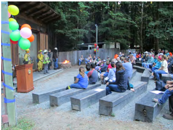
Smokey Bear's 71st birthday celebration, held August 8th had over 100 guests, and was joined by the Weott fire crew.