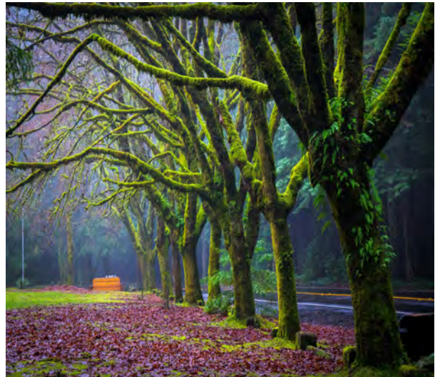
The 2014 winner was this image of Burlington in the fog.